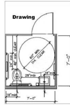
ADA Compliant Ground Level Lavatory Buildings