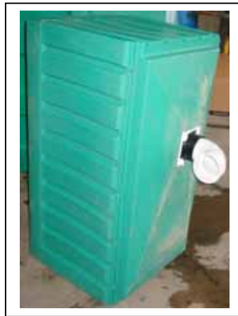
Fig. 3 Attach 90 Degree Elbow