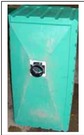
Fig. 2 Attach Bracket