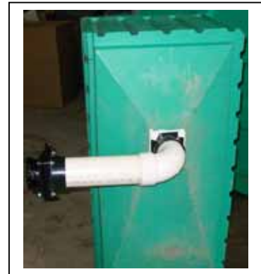
Fig. 5 Attach Dump Valve

After dumping the holding tank, pour several gallons of water to wash tank bottom and exit pipe.