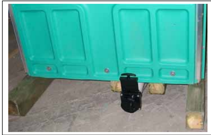
Fig. 1 Sani Jon® With 3" Dump Valve

Model SJ 450D (Dump Valve Toilet) Can Be Trailer Mounted